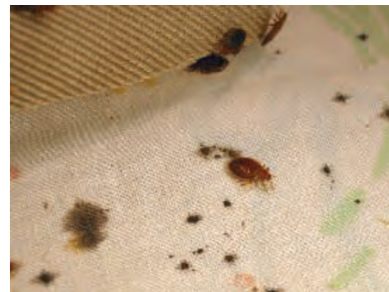
Adult bed bugs on a sheet showing typical staining.