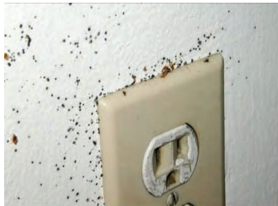
Bed bugs and their fecal spots on the wall next to an electrical outlet

Remember that bites alone do not mean a bed bug infestation. Confirmation requires finding and identifying the bugs themselves.